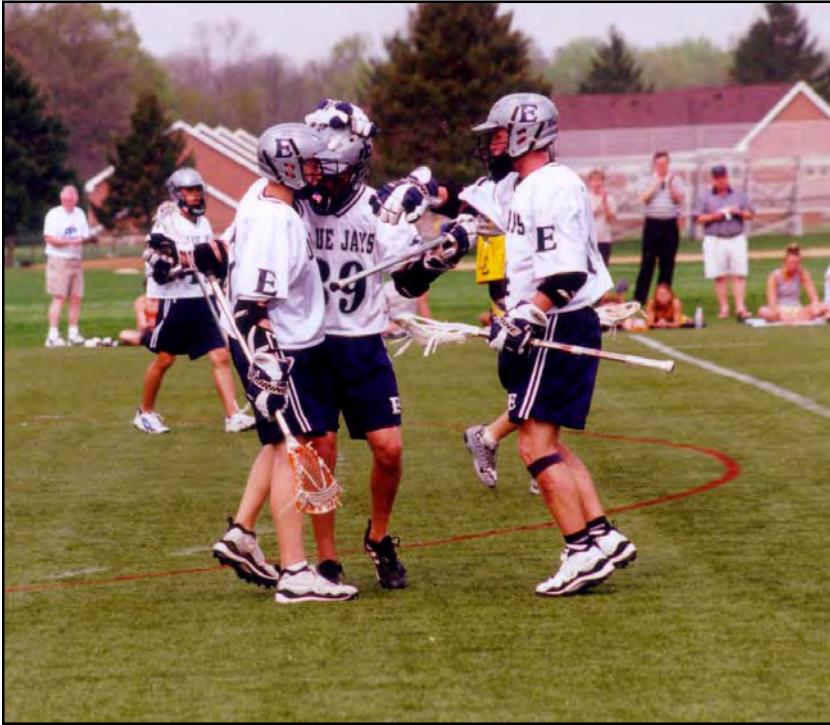
Both men's and women's lacrosse teams have quickly become popular and successful programs.

living conditions within the residence halls and throughout campus. Each year, the association and the RHCs provide more than 100 community-building programs and make physical improvements to the residence halls by working with the offices of College Life and Plant Operations.